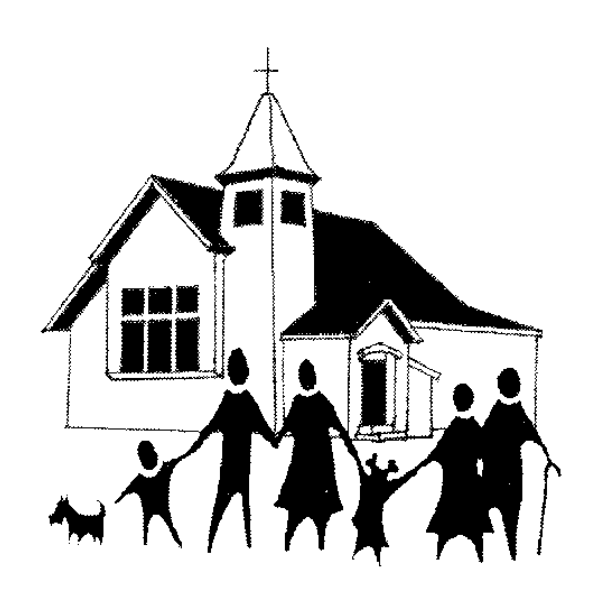
EMMANUEL LUTHERAN CHURCH JOYFUL † CARING † LOVING

elcshepherd.org \ - \ elcshepherd@gmail.com