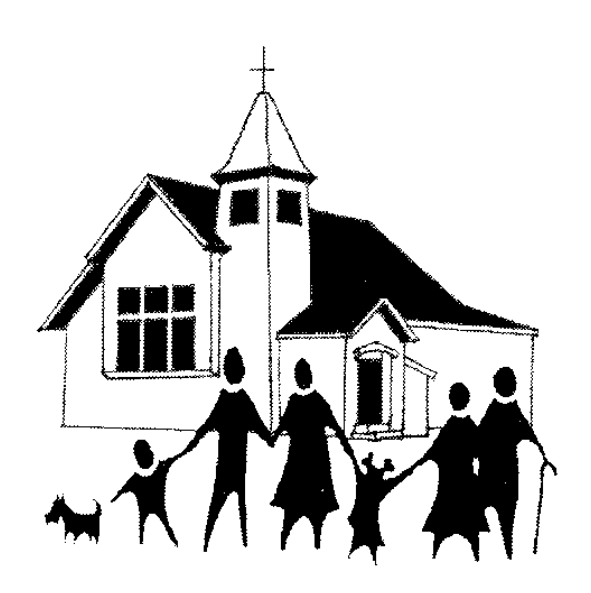
EMMANUEL LUTHERAN CHURCH JOYFUL † CARING † LOVING

elcshepherd.org \ - \ elcshepherd@gmail.com