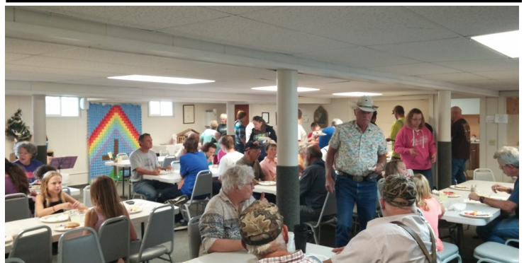
The Community Barbecues have been very successful this year. Thank you to everyone who helped!