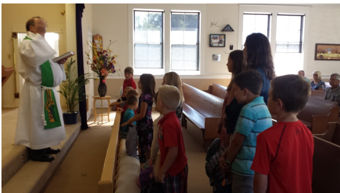
The blessing of backpacks, students and teachers on Sunday, August 21 st .

Come and join us on the 17 th as we get our hands busy doing God's work in our community.