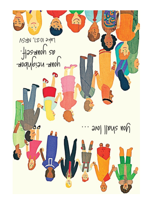
Emmanuel Lutheran Church P.O. Box 66 Shepherd, MT 59079 Address Service Requested