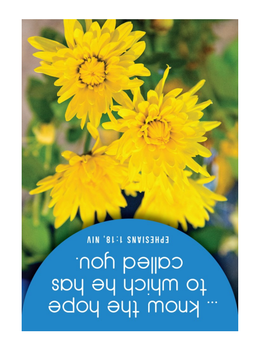
Emmanuel Lutheran Church P.O. Box 66 Shepherd, MT 59079 Address Service Requested