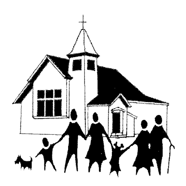
EMMANUEL LUTHERAN CHURCH JOYFUL † CARING † LOVING