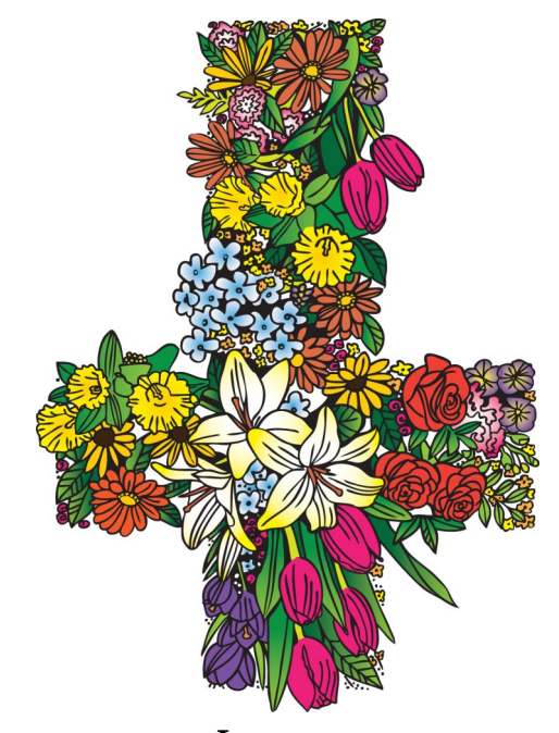
Address Service Requested Shepherd, MT 59079 P.O. Box 66 Emmanuel Lutheran Church