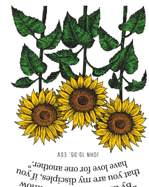
"By this all people will know