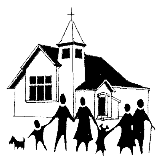
EMMANUEL LUTHERAN CHURCH JOYFUL + CARING + LOVING

to "follow God's plan for us to grow in faith, family, and community."