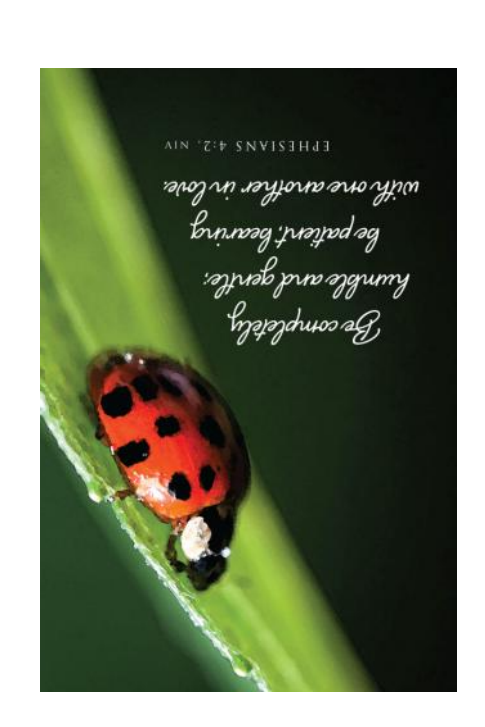
Emmanuel Lutheran Church P.O. Box 66 Shepherd, MT 59079 Address Service Requested