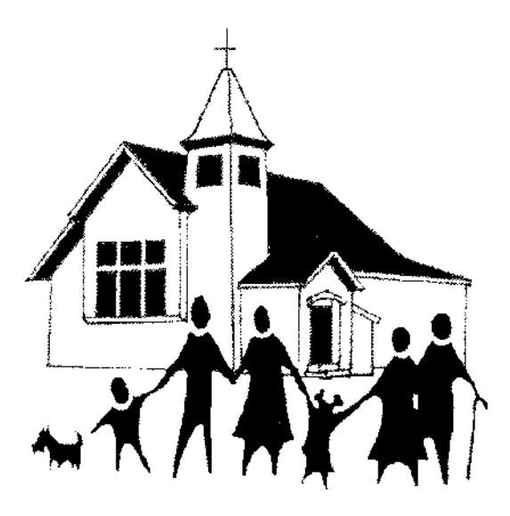
EMMANUEL LUTHERAN CHURCH JOYFUL † CARING † LOVING

emmanuelluthshepherd.com "Like" us on Facebook